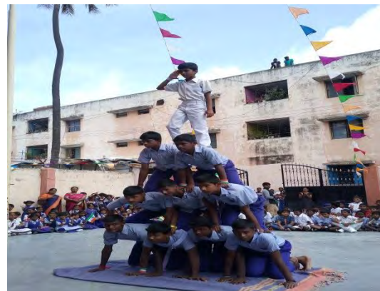
Pyramid by the high school boys

19. Road run event, 'Run For Bharath' - On the 70th Indian Independence Day there was another Event to motivate people to keep fit and run for our nation called 'Run for Bharath'. A five kilometer run during the dawn of Independence Day around RT Nagar in Bangalore. Organized by Jaya Karnataka, a Team of Jagruthi, Uttirna, Seva Sachin , HELP & Kingfisher.