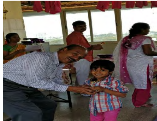
Children given prizes for their performances on Sports Day by Senior Teachers and Head Mistress