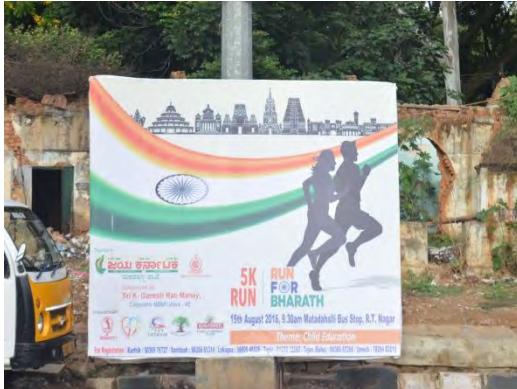
The big banner of 'Run for Bharath'