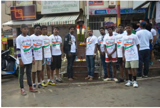
Six of our high school boys before the run