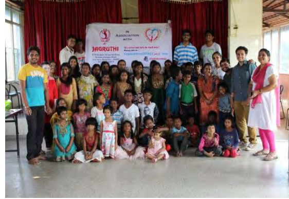
Children, volunteers, staff at the end of the summer camp