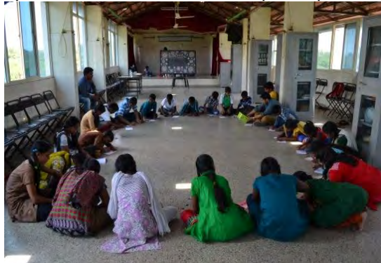
Children in 'Moral Story Writing' activity