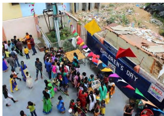
Inauguration of Children's Day Fun Fete & Carnival of Games