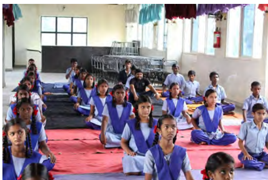
'Padmasana' by the children and volunteers