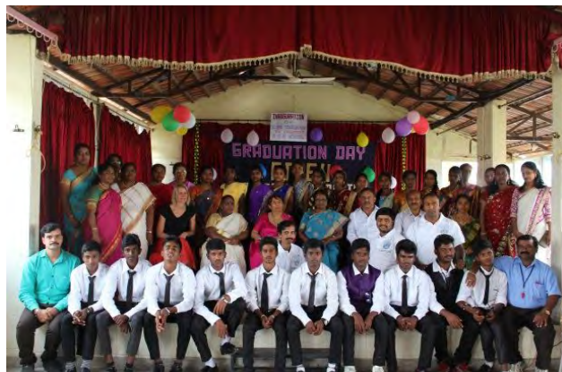
The 10 th std batch of 2015-16 with Principal, Secretary and other officers, teachers and guests