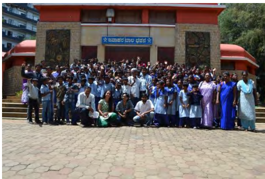
130kids from our School, staff and with the Manager of the theatre