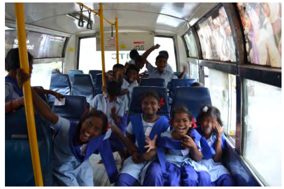
Children enjoy the journey in the bus