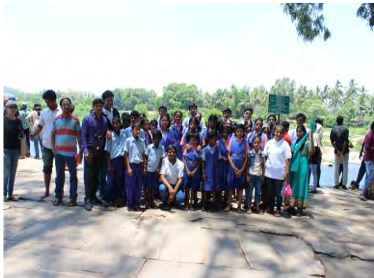
Children with volunteers and staff by a lake bed