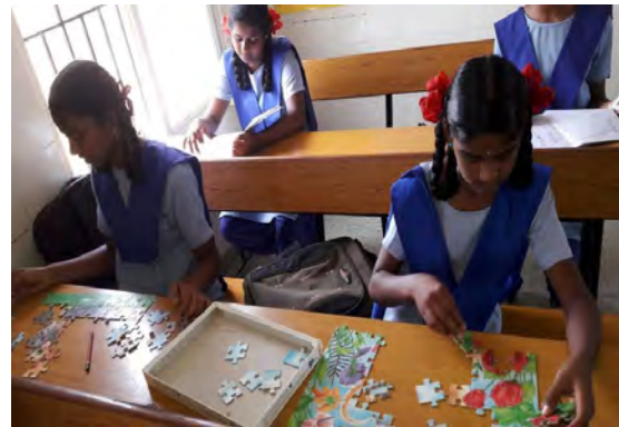
Children solving puzzles- scenery