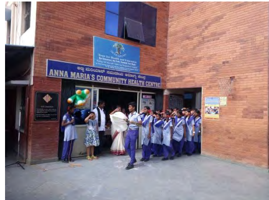
March past by the houses (teams) of the school