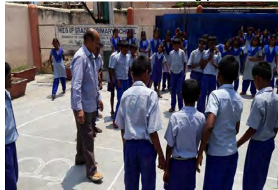
Outdoor games during summer camp