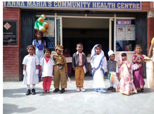
Playschool fancy dress for the occasion- dressed as prominent personalities