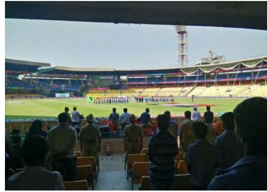
Children with volunteers and staff at the stadium during the Women's T20 cricket match between international teams

2. Innovative Summer classes (April 2016) - of various activities - English, Kannada, Hindi classes through games, activities- writing and oral, sports, Confidence building classes, Games for students and staff together, Awareness Sessions, Playschool Programs, Art & Craft and more at MEG School- Kids of Jagruthi and MEG School students from Doddigunta. Through these activities prizes were distributed to many prominent and active students.