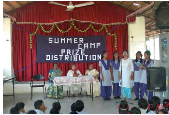
Group Song presented by teacher and students