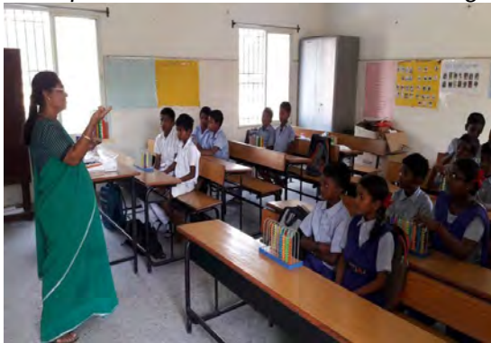
Teacher uses materials to define and exercise Arithmetic