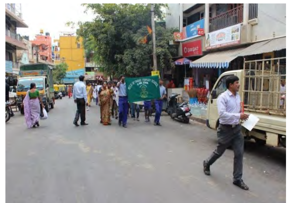
Before the govt missionary with doctors-children,staff & volunteers. Rally around Cox Town.