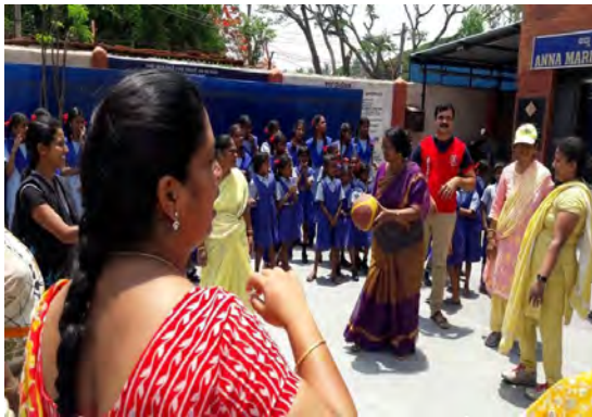
Principal & teachers involve in summer games with kids

2. Innovative Summer classes (April 2016) - of various activities - English, Kannada, Hindi classes through games, activities- writing and oral, sports, Confidence building classes, Games for students and staff together, Awareness Sessions, Playschool Programs, Art & Craft and more at MEG School- Kids of Jagruthi and MEG School students from Doddigunta. Through these activities prizes were distributed to many prominent and active students.