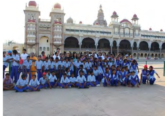
Children in front of the Mysore Palace with volunteers