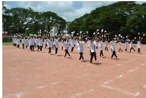
Girls' dance drill that left everyone astonished with their elegance and timing of display and coordination