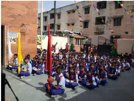
Students listen to the speeches