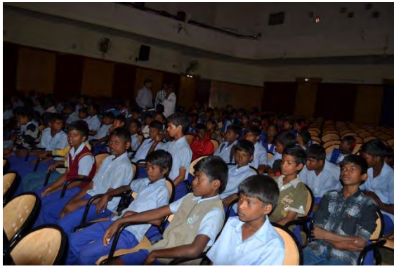
Children seated to watch the stage play