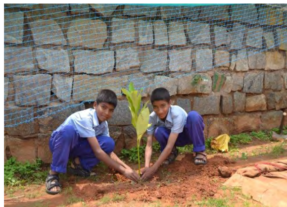
Our kids plant a sapling in one area