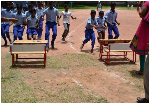
Boys doing their best in Obstacle race