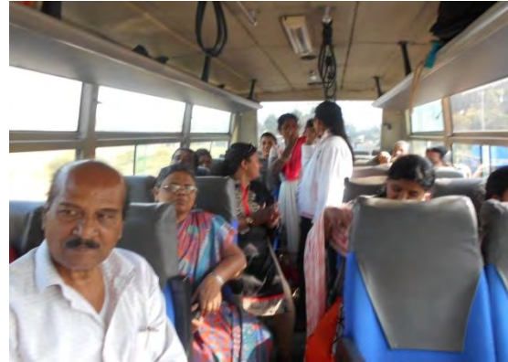
Teachers' Trip to Mysore along with Principal and all other staff of the school