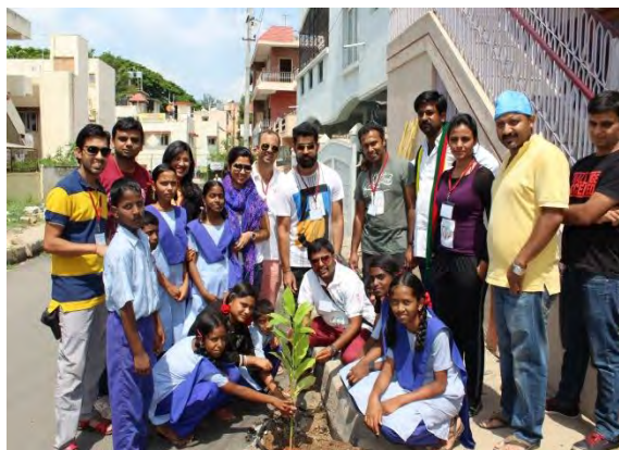
Volunteers, staff with Children plant a sapling together