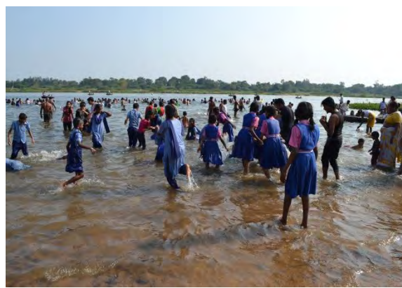
At the Somanthpura Keshava Temple-Children, staff and volunteers together. Children play in the waters before the boat ride.