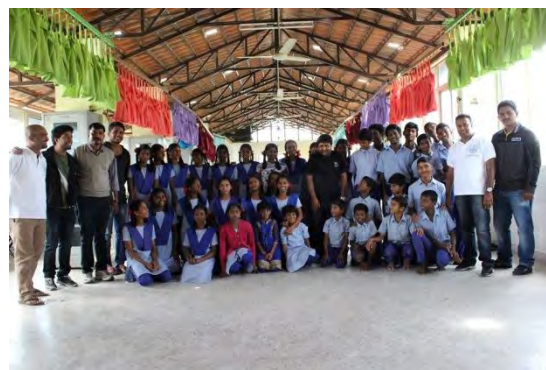
Children with Yoga trainer, staff & volunteers