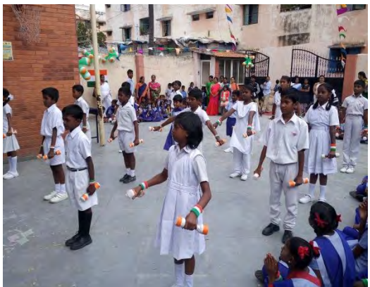
Drill by primary school students