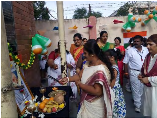
The chief guest performing a puja