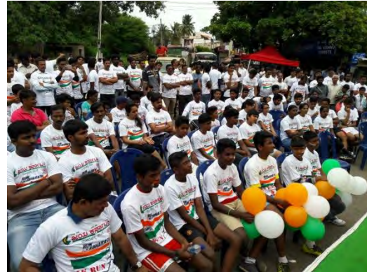
Students with staff at the instructions