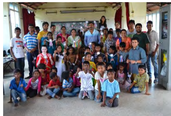
Children, volunteers, staff after the Summer Camp