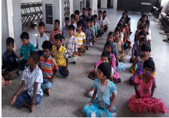
Children doing meditation in the morning as the initial part of the program

meditation, moral storytelling, action songs, life skill learning, creative thinking, and cultural programs, outdoor sports, ended with final day of talks, dance and music.