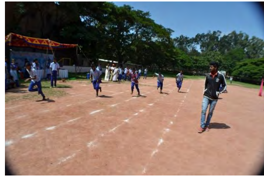
Boys in the long distance run of 1500 meters