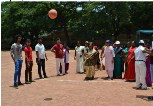
Staff Game that was played enthusiastically by staff and volunteers